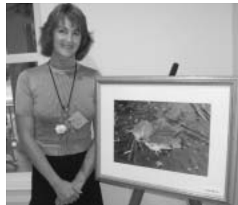
"Frozen Leaf and Reflections" captures Cathy Summers's photographic prowess. She says, "Photography is my passion and avocation."