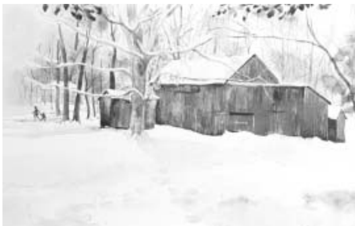
Bill Abel's watercolor, "Winter Still," captures reflections of light on snow on the barn in Cherry Hill Park.

and later to Israel, where she began to paint. She has exhibited in Israel, Spain, Italy, and the United States. Barker-Barzel specializes in oil paintings. Her style depends on the subject matter; she favors expressionism, impressionism or surrealism. "I am always searching for interesting characters or faces to paint," said Barker-Barzel. "I also enjoy painting landscapes and seascapes. My 'Mothers of Israel' series depicts mothers and children dealing with loss."